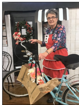
Christmas in Paris Tea