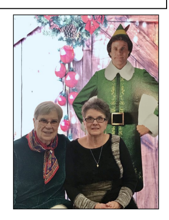
Parish Christmas Party